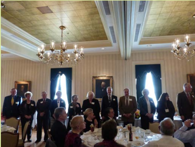
2015-2018 Board of Assistants