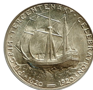
1920 US POSTAGE STAMPS 1 cent - Mayflower at Sea 2 cent - Landing of the Pilgrims 5 cent - Signing of the Compact